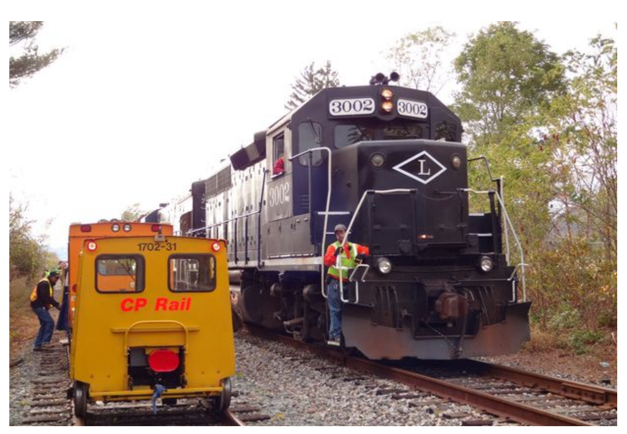
A railcar waits on a siding for a train to pass.