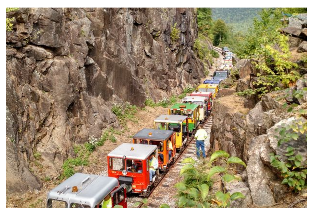
Just below Crawford Notch in the White Mountains of New Hampshire, a railcar excursion pauses for a lunch break on rails that were formerly part of the Maine Central Railroad, now part of the Conway Scenic Railroad.