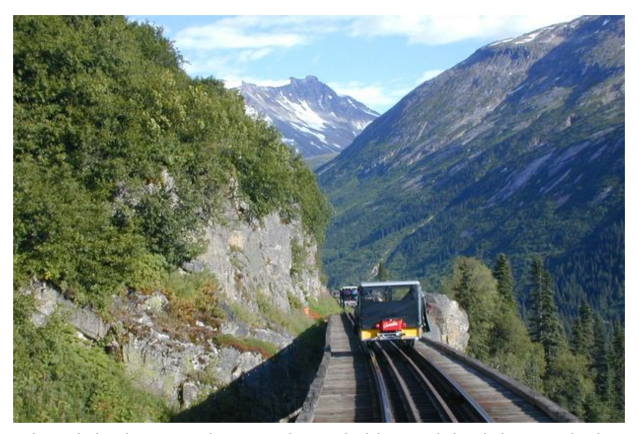
Railcars ride the White Pass & Yukon Route railway north of Skagway, Alaska, which was completed in 1900 and today operates as a historical tourist attraction.

The bottom line is that the fees are generally modest enough that, along with the relatively inexpensive entry fee to buy a railcar, it keeps the hobby affordable. Last month, for example, about 20 riders took an overnight, leaf-peeping excursion on the Vermont Rail System covering a 220-mile round trip along the pastoral Connecticut River. It cost $410 per car (or $205 per person assuming two riders per car.) But that included railroad fees, overnight hotel accommodations, three meals plus bus transportation to and from restaurants.